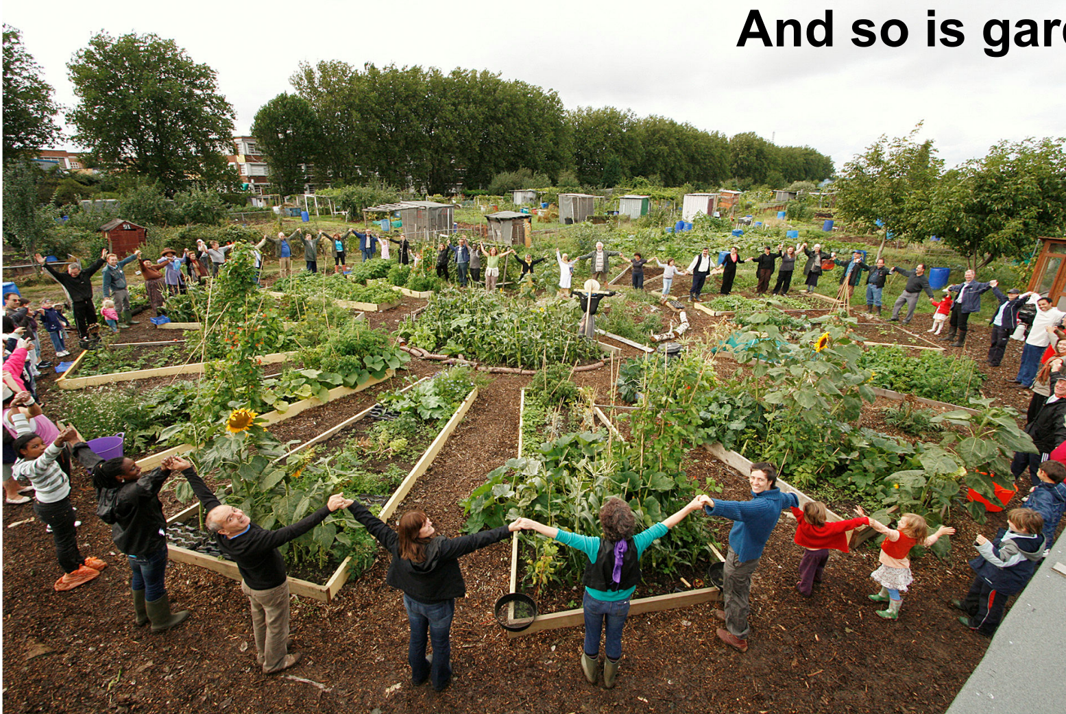
Under One Sun Allotment